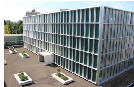
● Building 325, 228